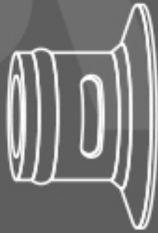
Splash Resistant Filter