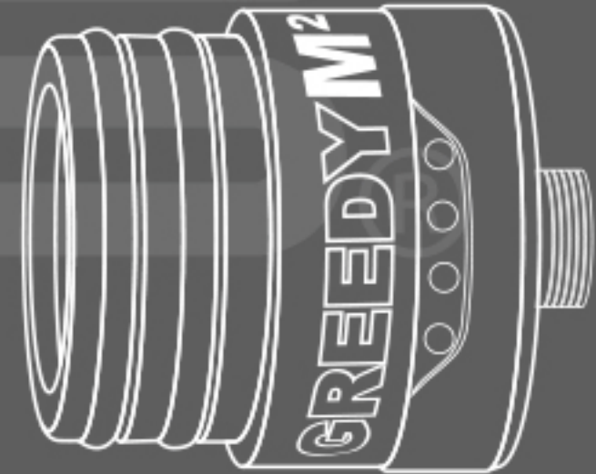
Adjustable Airflow Base