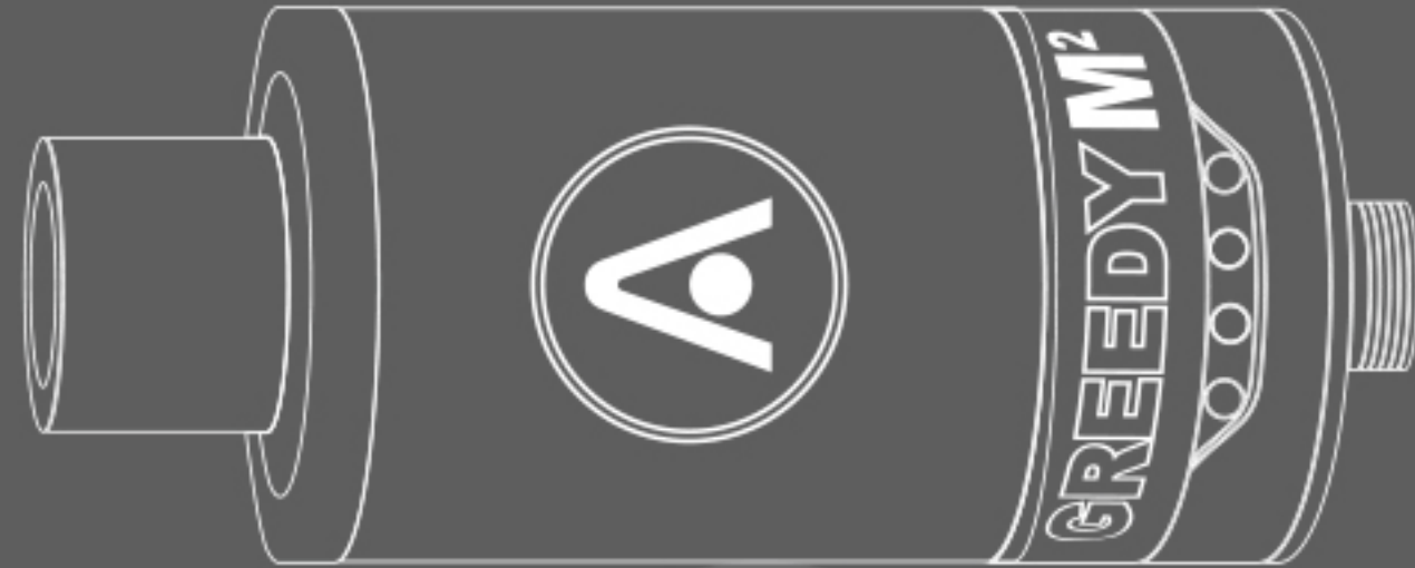
Dry Herb Filter